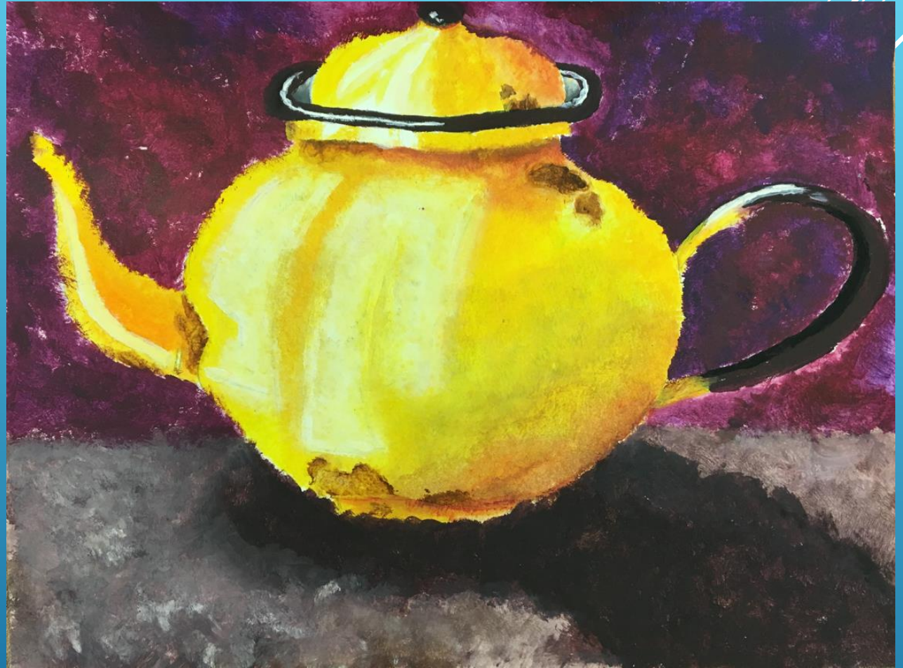
Single Object Still Life