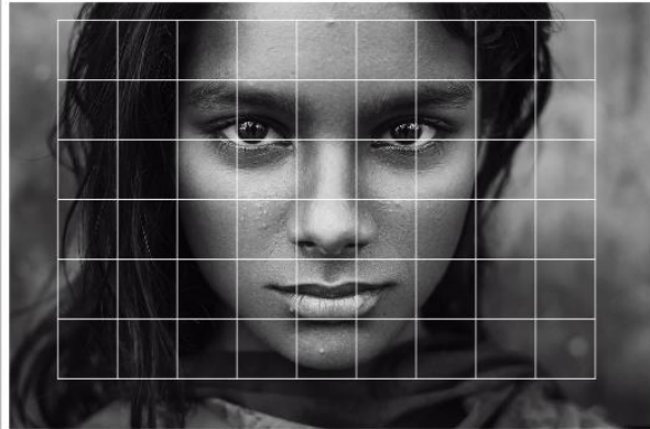
6 inch x 9 inch box (inch grid)