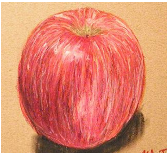
Long and Short Strokes