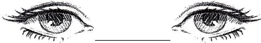
Approx 1 Eye space

Drawing #1 Practice the basic outline and structure of an eye. Remember that the eye includes lids and eyelashes. Use the step by step guide if necessary to create two basic eyes that are the correct basic oval shape with pupils and eyelashes.