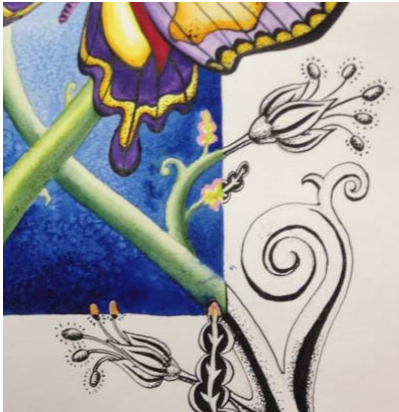
Example done with watercolor